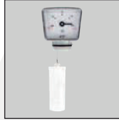
Clock Face GA.CG.4