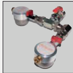
90° Tee AC.TFK.90T