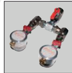
Parallel Tee AC.TFK.PT