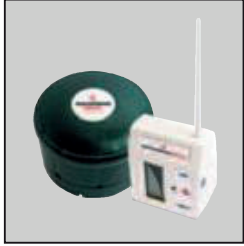
Watchman Sonic GA.WA.ST