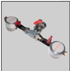
Straight Tee AC.TFK.ST